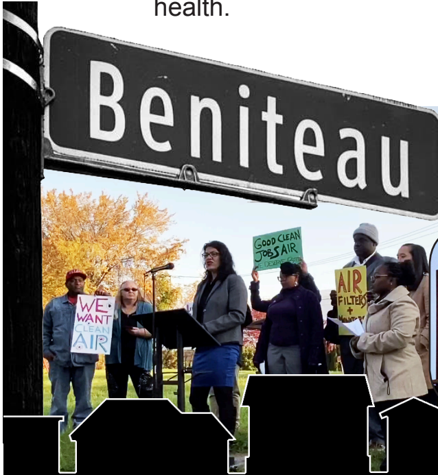
Residents from Beniteau and the "Impact Area" join a press conference on Air Quality around Fiat Chrysler's new assembly line and paint plant with US Congresswoman Rashida Tlaib, State Senator Stephanie Chang and environmental justice advocates.